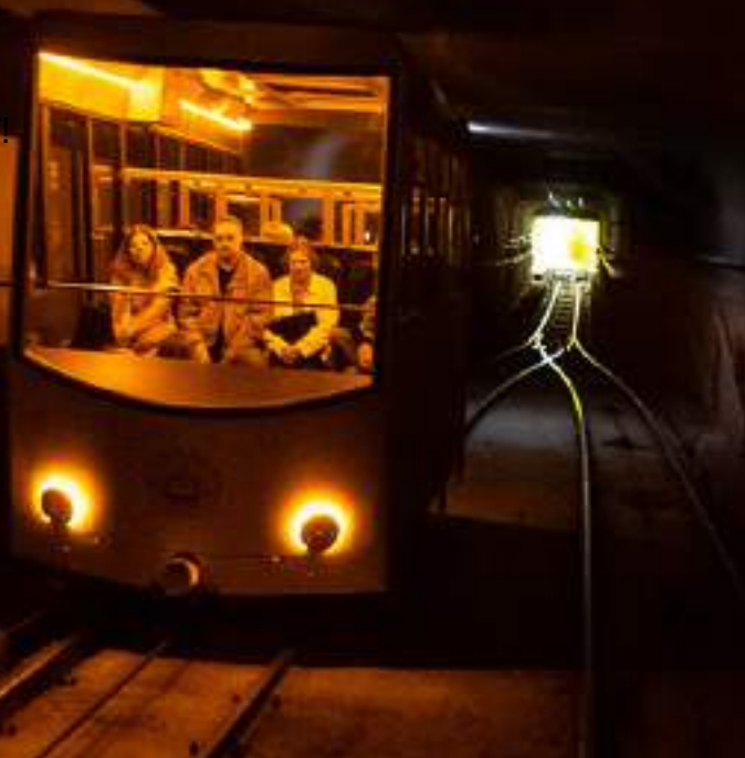
Take the cable car to the top of Lycabettus Hill. $49+ (-6)

Top tip for parents: Get a day-pass for the tram and hop on and off at your leisure, exploring the scenic coastline from Palio Faliro to Voula.