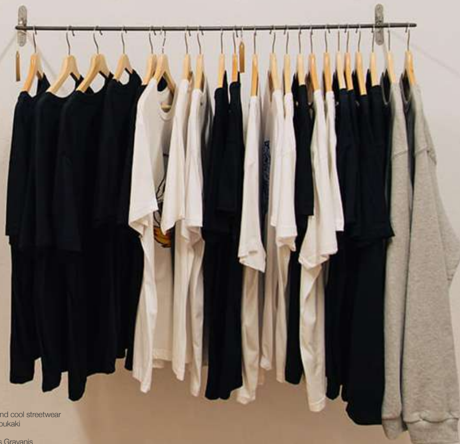
Tiles for miles and cool streetwear at Sou-Sol in Koukaki

Afterwards, wander through Koukaki , a trendy neighbourhood full of cool cafés. Opt for the industrial vibe at Kinonó , or join the hipsters gossiping over smoothies and croque monsieurs at Bel Ray . Check out cool design shops like Mon Coin , Val Gaoutsi , Trabala and ME THEN for locally-made jewellery, ceramics and fashion—some of it produced on the premises. Then make a date with a glass of natural Greek wine at Materia Prima , paired with glazed sweet potato with gorgonzola and pear.