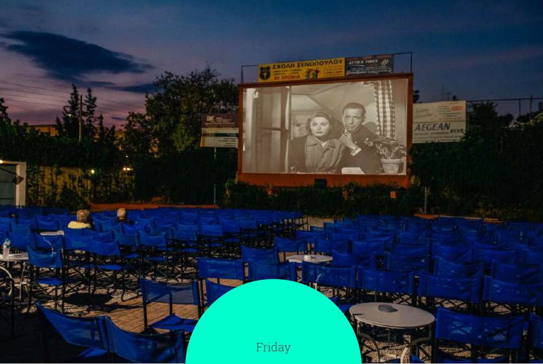
Cine Akti, playing a classic film under the stars