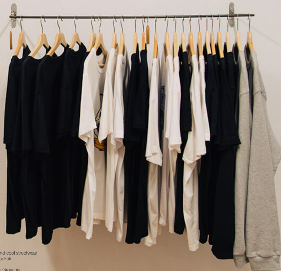
Tiles for miles and cool streetwear at Sou-Sol in Koukaki

Afterwards, wander through Koukaki , a trendy neighbourhood full of cool cafés. Opt for the industrial vibe at Kinonó , or join the hipsters gossiping over smoothies and croque monsieurs at Bel Ray . Check out cool design shops like Mon Coin , Val Gaoutsi , Trabala and ME THEN for locally-made jewellery, ceramics and fashion—some of it produced on the premises. Then make a date with a glass of natural Greek wine at Materia Prima , paired with glazed sweet potato with gorgonzola and pear.