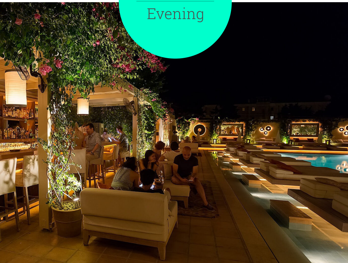
Cine Akti, playing a classic film under the stars